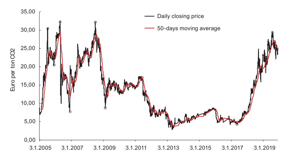
Fig. 20.1 Fluctuations of the price of EU CO<sub>2</sub> emission allowances